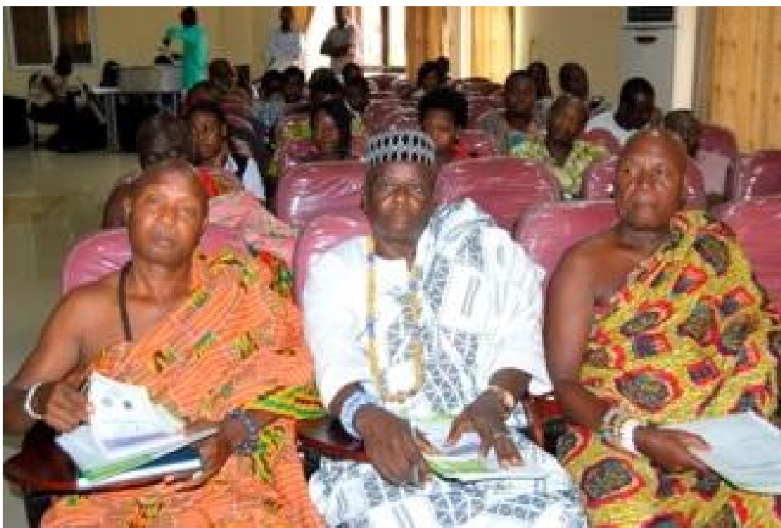
A section of participants at the workshop