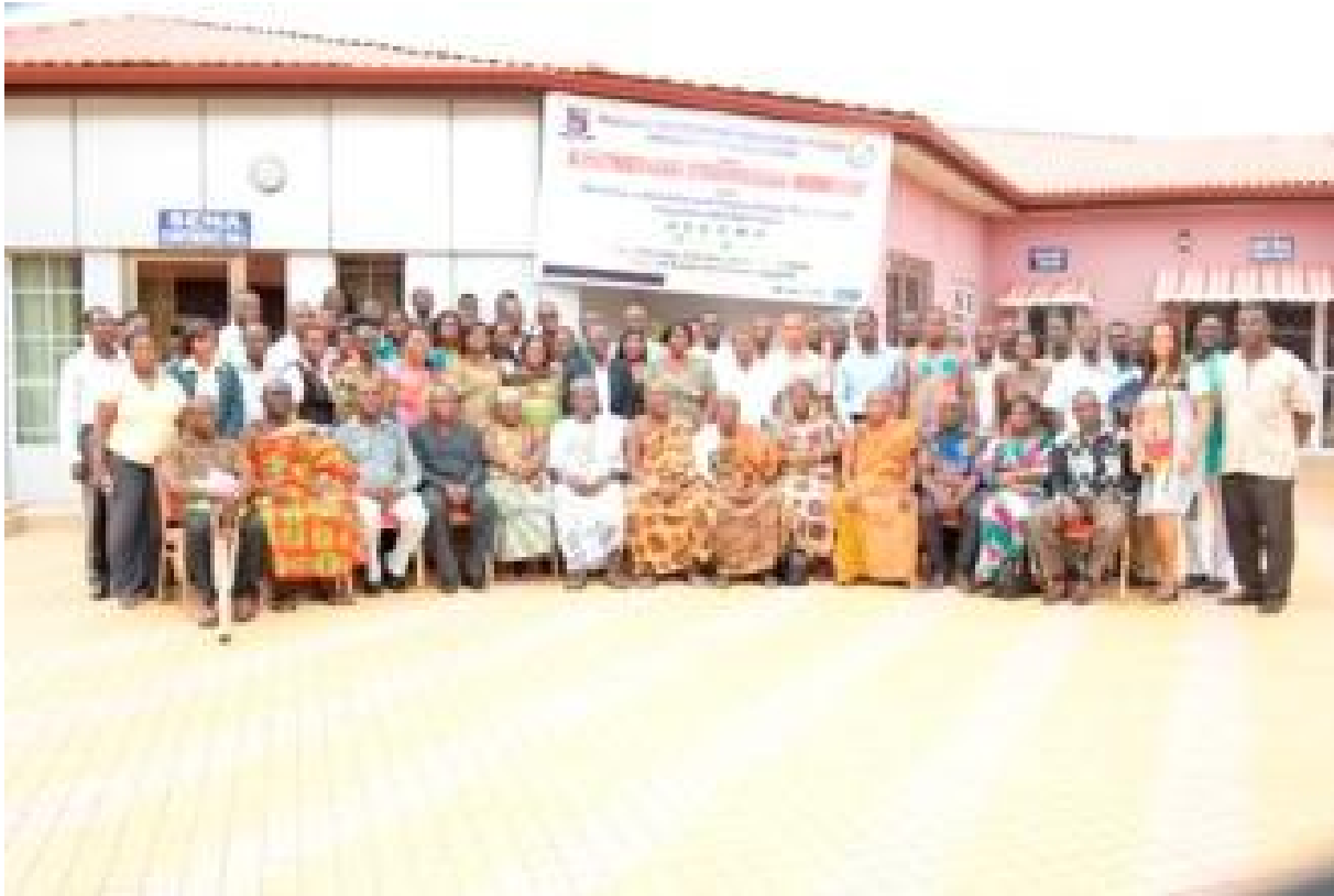
A group picture with the stakeholders