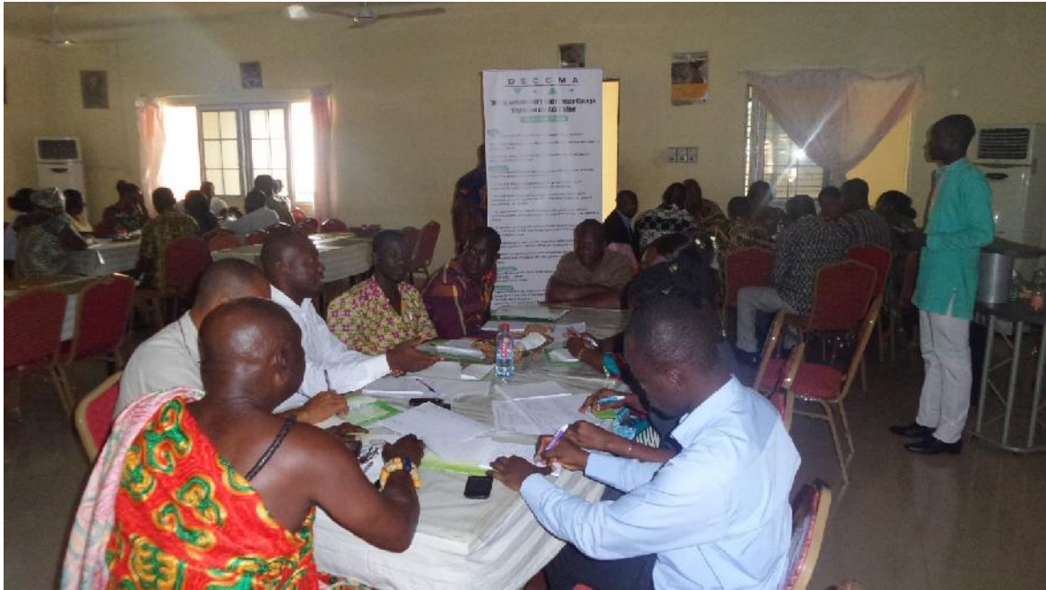
Sections of the participants during the brainstorming sessions