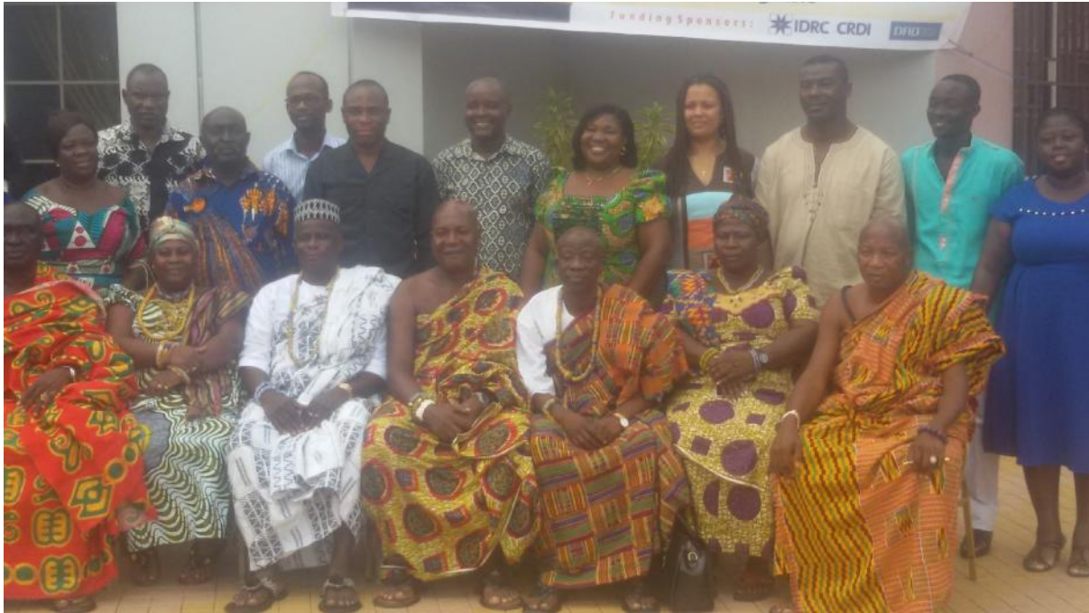
DECCMA Team Members with Traditional Leaders and Chief Executives