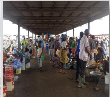
Mostly marketed locally