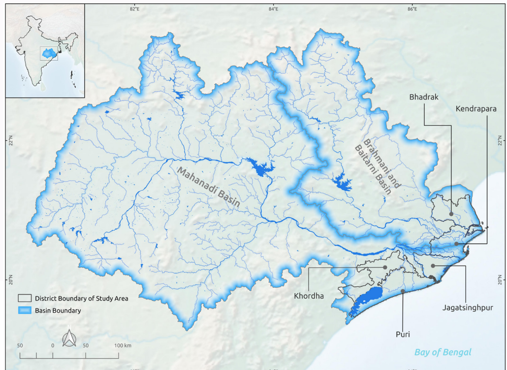
Figure 1: Mahanadi-Brahmani-Baitarani river basin with the study area district boundary

The changing nature of land cover also affects flood risk by increasing vulnerability to flood exposure.