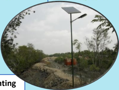
Solar Street Lighting