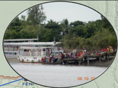
Floating Medical Unit