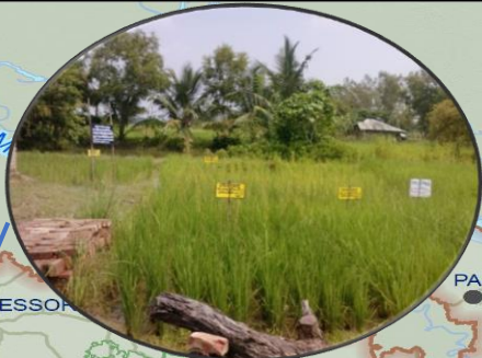
Cultivation of Salt Tolerant Paddy Varieties