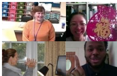
Music outreach session on Zoom!