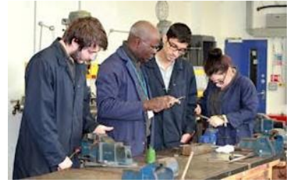
The report On- and off-the-job Training in Apprenticeships in England was published on 5 February 2021

The report presents the findings of the two studies, both of which adopted a case study approach based on interviews with employers and apprentices across a range of sectors.