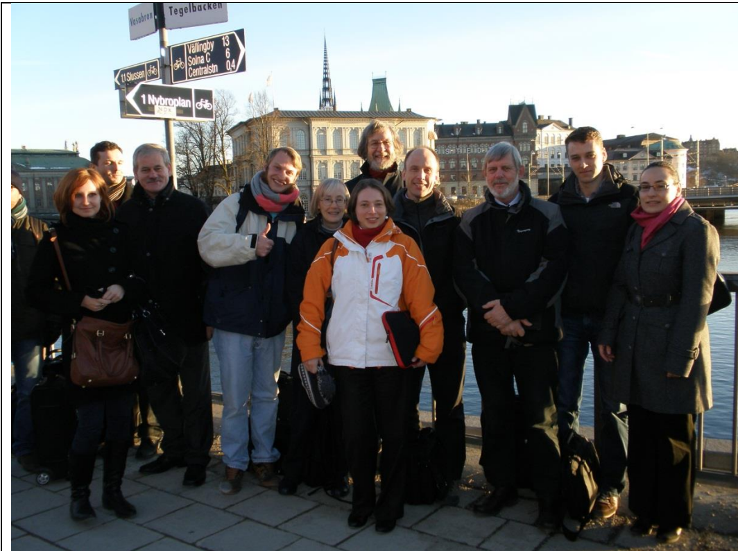
Project partners at kick-off meeting in Stockholm