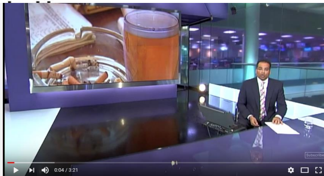
Alcohol: new risk of cancer even for moderate drinkers