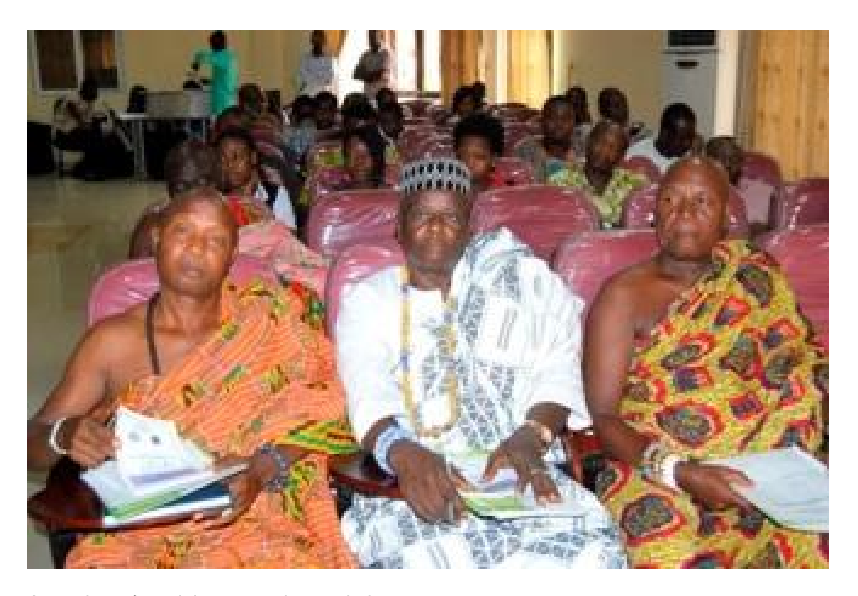
A section of participants at the workshop