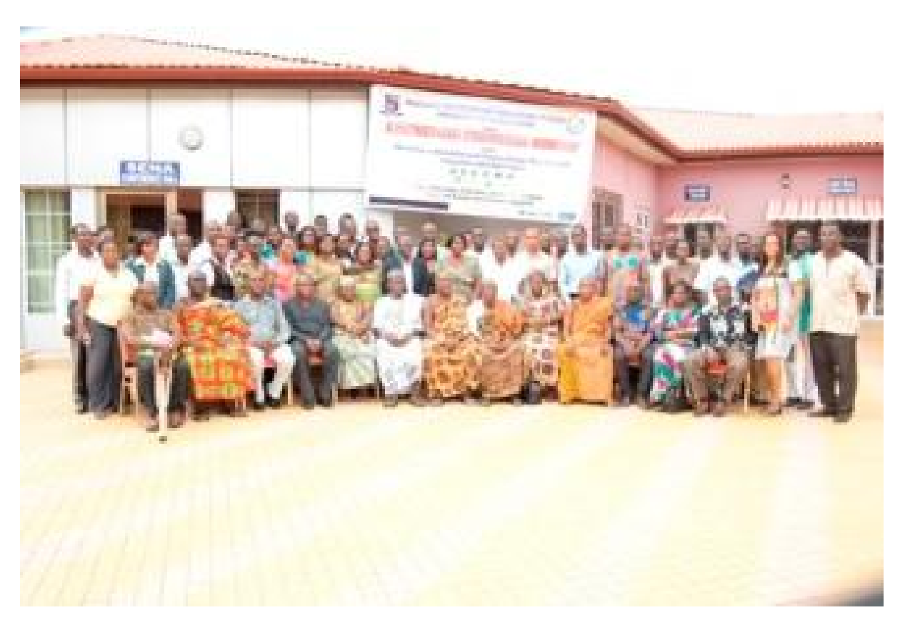
A group picture with the stakeholders