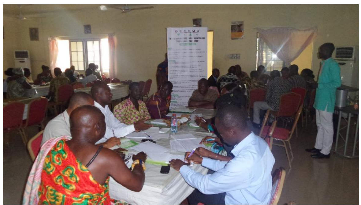
Sections of the participants during the brainstorming sessions