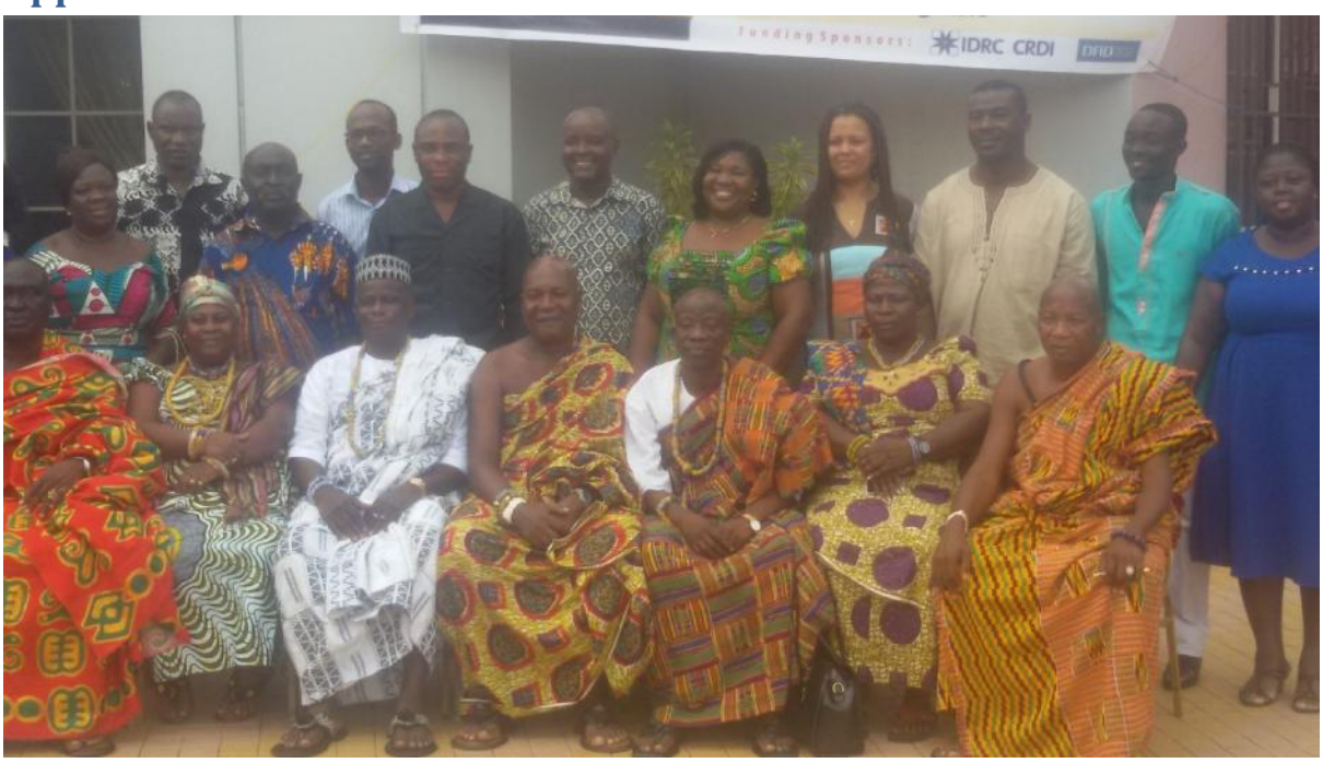
DECCMA Team Members with Traditional Leaders and Chief Executives