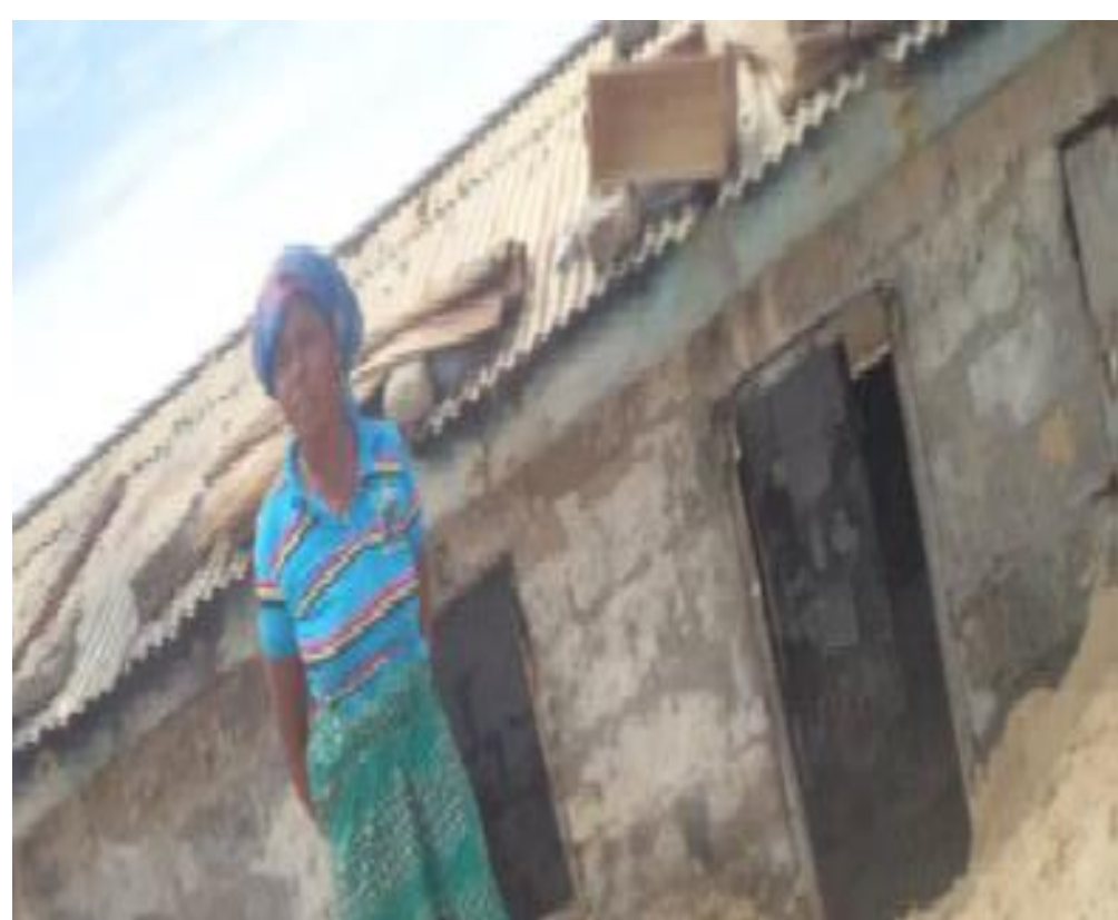
Totope a community in the Ada East District has been covered almost by sand.