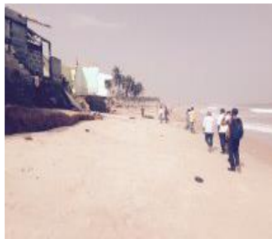
Coastal erosion in the Ningo-Pramprom District