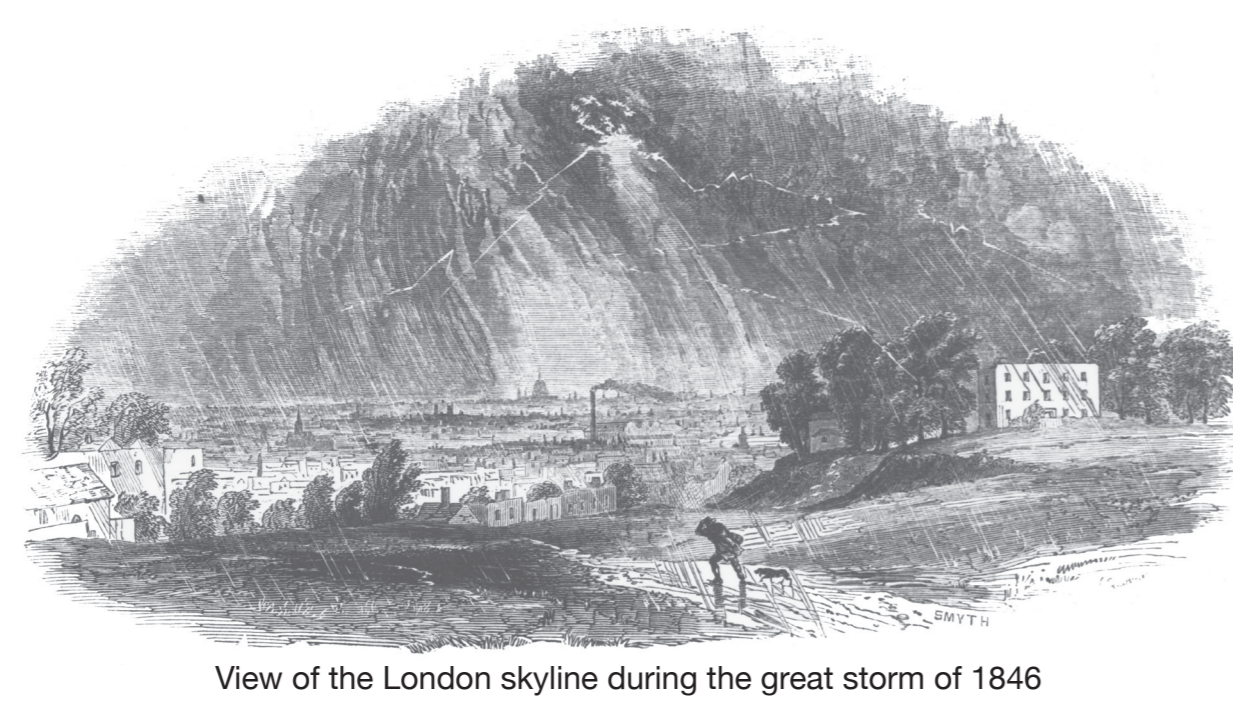
View of the London skyline during the great storm of 1846

The Point and the Heath to the north of the A2 are owned by the Crown as manorial waste, but held in trust by the Royal Borough of Greenwich for the people of London in perpetuity.