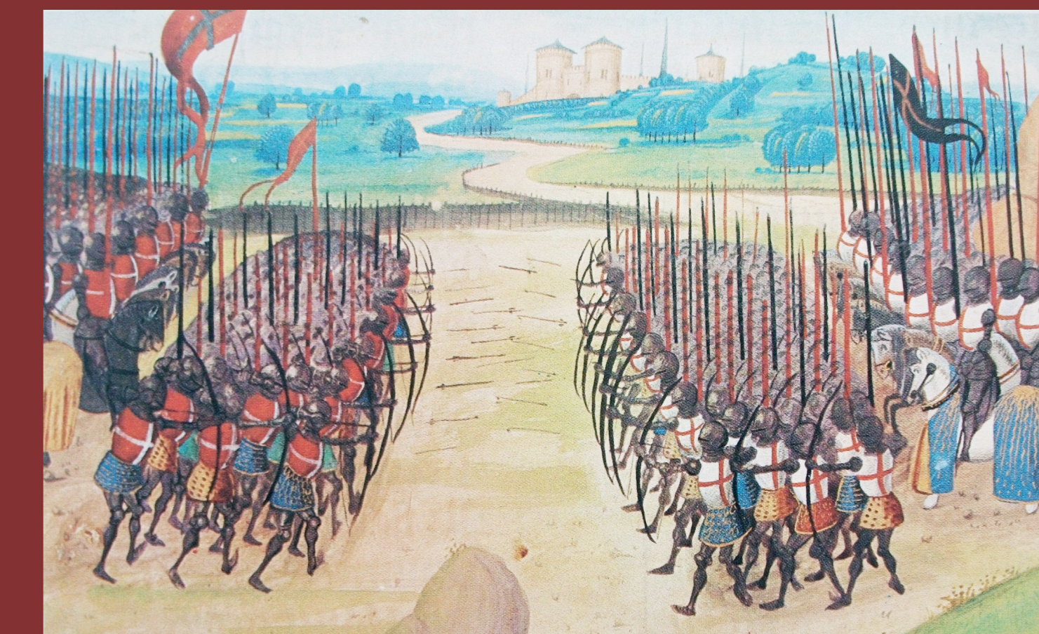
15th century Miniature, Enguerrand de Monstrelet

On 23 November 1415, the Lord Mayor, Aldermen and citizens of London packed Blackheath to welcome Henry V home from his victory at Agincourt. Henry returned to a hero's welcome, with the Londoners riding out to receive him formally at Blackheath and escorting him for five hours to London Bridge. In London, Henry was treated to a lavish pageant which celebrated the city itself, as well as his own triumph.